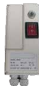
Option : Plastic control box For single phase(3wire)